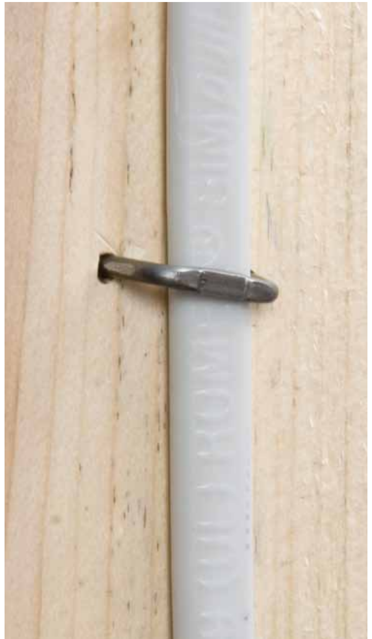
Photo 5: Example of potential line-to-ground arc fault (wire stapled too tight).

installation or due to abuse, defective or misapplied equipment, moisture or contaminants introduced between conductors of different voltages, loose or improper connections, even connecting an aging appliance with a concealed internal arc fault to a new electrical system – any of these situations and many more can cause arc fault induced fires in new construction. As much as we might like to think of new construction as safe, the simple fact is that arc faults do not discriminate between new and existing construction. Most of the reasons commonly provided for electrical fires – overloading of circuits, frayed or worn wiring, dust-covered televisions, and the like – are contributors, not causes. These conditions do not themselves produce enough heat to spark a fire, but they can certainly contribute to arcing. When added to these common conditions, arcing creates spectacular amounts of heat – enough heat to spark a fire many times over.