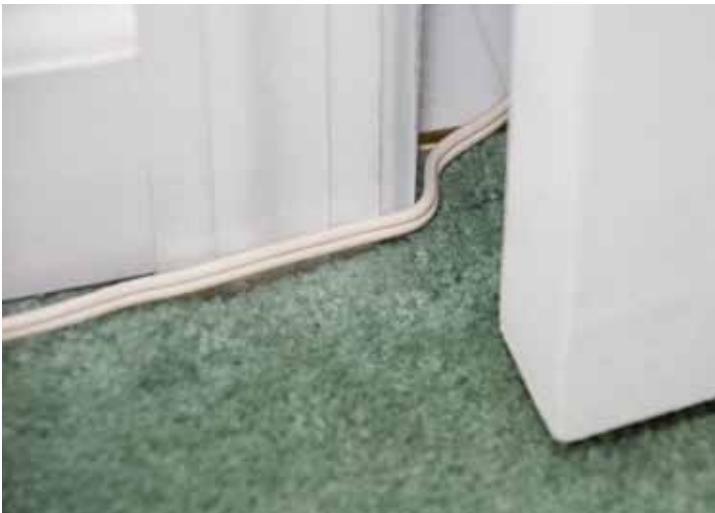
Photo 1: Example of line-to-neutral arc fault (door pinching power cord).

A damaged power supply cord can be an example of a line-to-neutral arc fault. Power supply cords can experience repetitive flexing that, over time, may damage the insulation and/or conductors inside. This flexing may be caused by repetitive use – plugging and unplugging a hair dryer day after day or wrapping a cord around a toaster for storage, for example – or from a door or other weighty obstruction that continually pinches the cord.