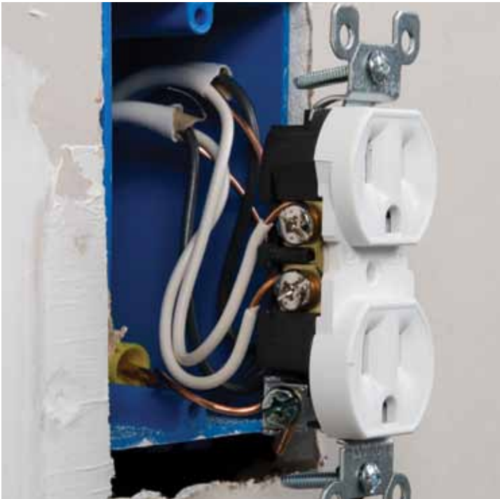
Photo 4: Example of series arc fault (pushing receptacle into work box).

In the example above, pushing the receptacle into the work box created a counterclockwise torque on the screw terminal. This torque could loosen the connection if it were not tightened sufficiently. This loose connection may carry current without arcing after installation. However, intermittent current flow is part of the design of every electrical system and appliance. With very few exceptions, electrical circuits do not run continuously. Loads cycle on and off, either manually or automatically. This intermittent current flow creates heating and cooling cycles at the screw terminal electrical connection. This cycling can cause a thin oxidation layer to form on the connection surfaces. This oxidation layer acts as an insulator. However, the typical 120VAC line voltage is enough to exceed the insulating capacity of the oxide layer. When the voltage exceeds the insulating value of the oxidation layer, electrons jump the insulating gap, allowing current flow in the form of an arc fault. The increased heat from arc formation further accelerates the formation of a carbonized path.