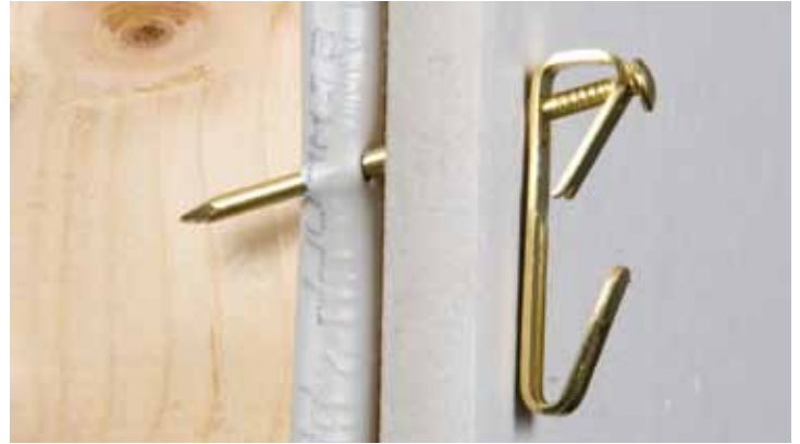
Photo 2: Example of line-to-ground arc fault (nail puncturing NM-B wire).

A line-to-ground arc can occur from an event as simple as hanging a picture. Very few people know what is behind the drywall when they drive a nail. The wiring in most homes, typically NM-B wire, runs behind this drywall. The nail driven to hang a picture can easily penetrate the insulation of NM-B wire. NM-B wire typically includes a bare ground wire positioned between individually insulated hot and neutral conductors.