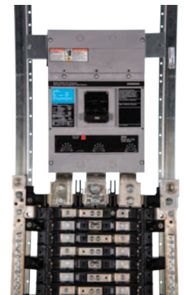
300A Main installed. These Revised P1 kits can now be used as top or bottom feed.