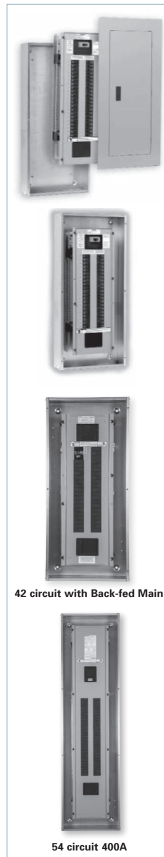
42 circuit with Back-fed Main