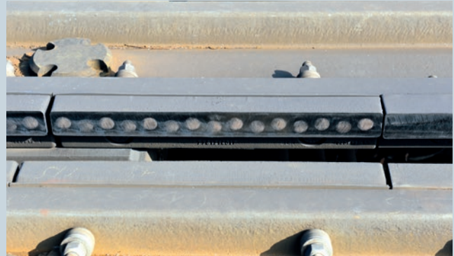
Retarder segment (braking beam with PUCK inserts)

Trackguard® is a registered trademark of Siemens AG.