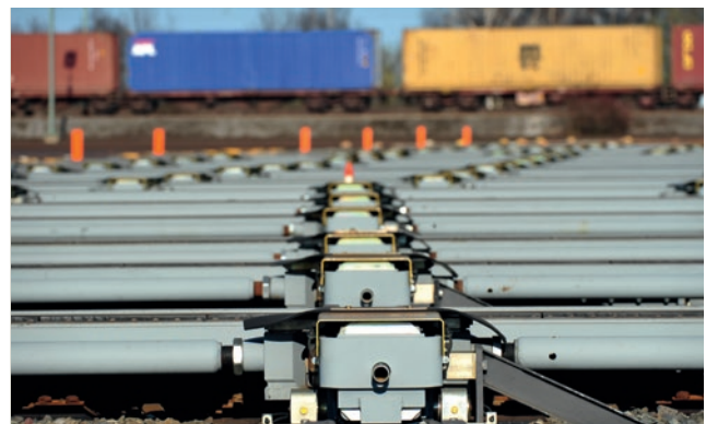
Retarder segment (retarding beam with PUCK inserts)

Dimensions compatible with those of existing retarder segments