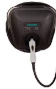
240 V Plug from behind (Plug is hidden)