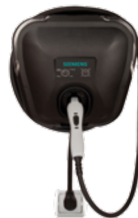
240 V Plug External