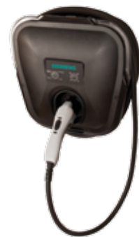
Hardwired via bottom fed conduit