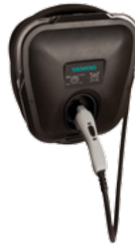
Hardwired from behind

The Siemens VersiCharge devices can be wired using one of four options: